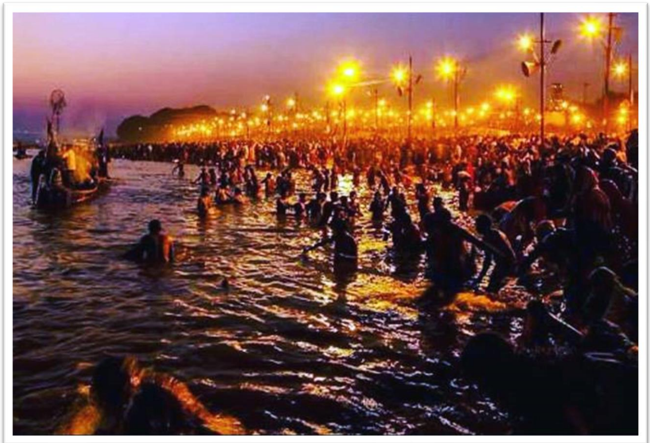
THE KUMBHA MELA CELEBRATION

Please note For those arriving early, below is the optional add-on tour including the Taj Mahal, Brindaban, the boyhood home of Lord Krishna