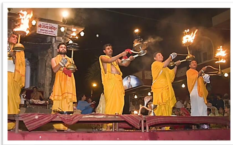
Sadhus celebrating Arati on the Ganges